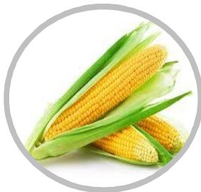
CORN ON THE COB