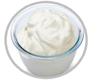
GOAT MILK YOGURT