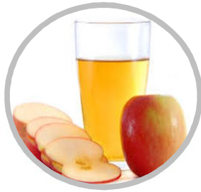
APPLE CIDER VINEGAR